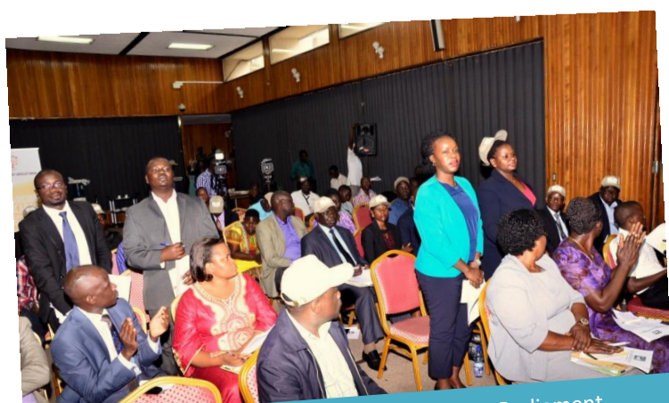
CSBAG team during the launch of the Forum at Parliament

While addressing the audience, the Chairperson of the Forum commended the Civil Society Budget Advocacy Group (CSBAG) for its support, which has so far enabled the forum come this far. CSBAG has been at the center of this process and are excited about this development. For CSBAG it is through such a forum that public finance management in Uganda would be championed. And we hope that various stakeholders can take collaborate and link with this forum for promoting prudent public finance management in Uganda.