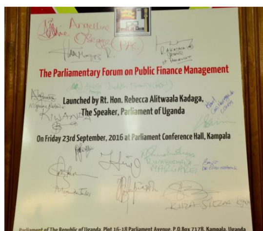
Signature Board signifying the launch of the Forum