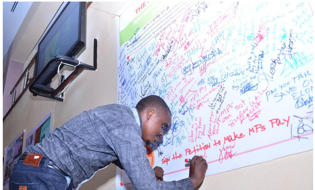
Citizens signing as a symbolic call for the president to assent to the Income Tax (Amendment) bill, 2016