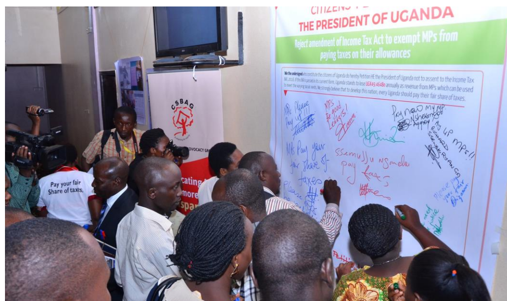
Citizens at the launch of the 5 million signature petition asking H.E the President to no assent to the Income Tax (Amendment) Bill, 2016 on 20 th April 2016 at

Civil society organizations, the law society and Kampala City Traders Association (KACITA) have a launched a campaign to collect 5 million signatures to ensure that MPs allowances are taxed. The signatures will be presented to President Museveni.