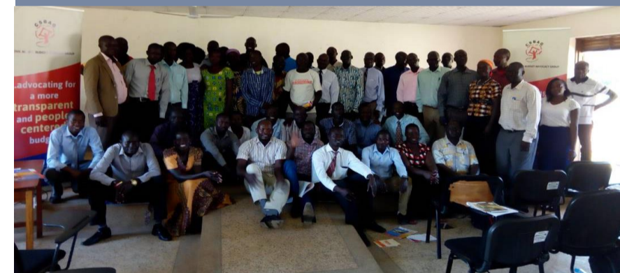
Members of district councils, Participatory Budget Committees, and other CSOs at the end of a meeting in Northern Uganda last week.