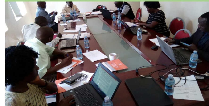
CSO participants from Teso sub-region discussing avenues to influence district Budgets recently. | @CSBAG2017