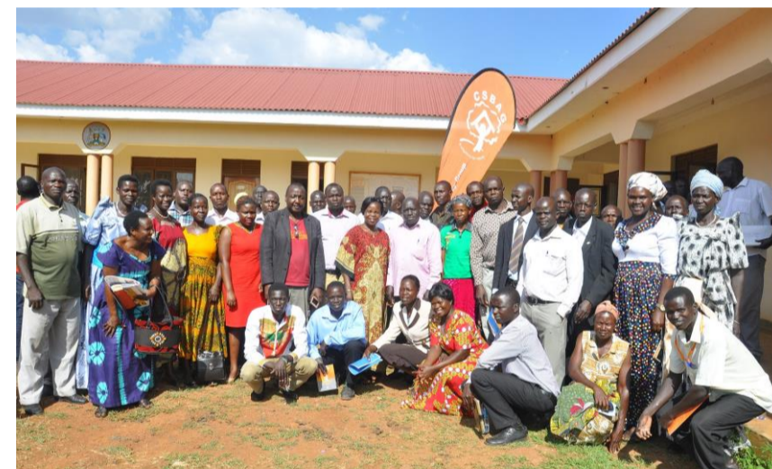
Members of Parliament interacting with the Agago district technocrats, councilors and the Citizens about the capacity of councilors to review district budgets at Agago district Local Government. |@CSBAG2017