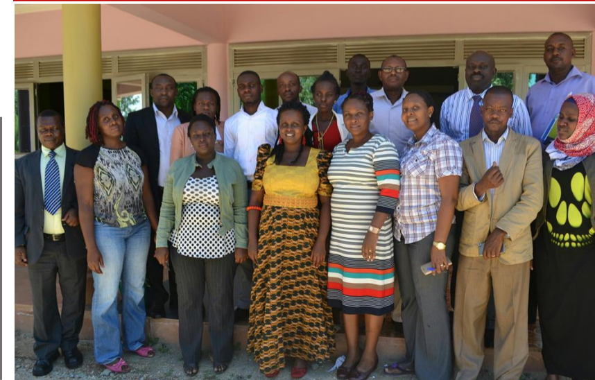
Bunyoro Regional CSO Budget Coalition after concluding a review meeting to develop regional position papers on the National Budget FY 2017/18. CSBAG conducted this process happened in 9 regions altogether