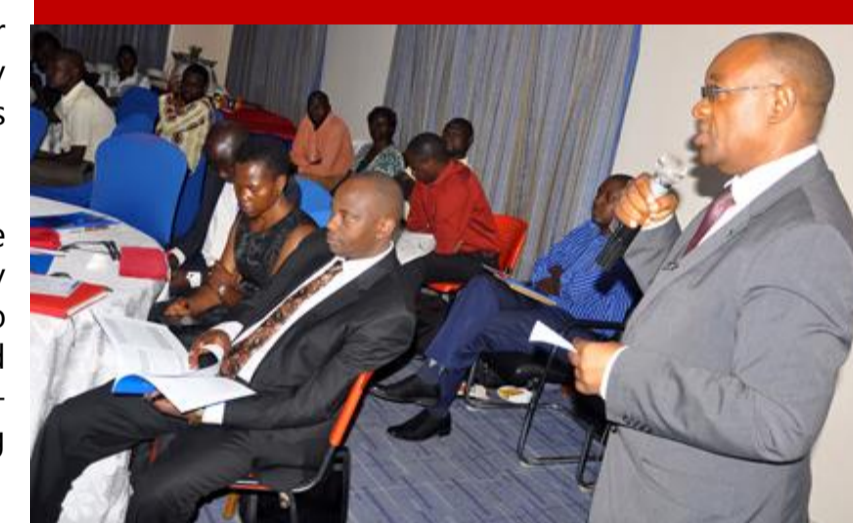
The chairperson of Parliamentary Committee on Public Service and Local Government, MP Raphael Magezi emphasized the importance of adequate financing for local government for economic development at a high-level meeting on 21 st January 2017 | @CSBAG2017