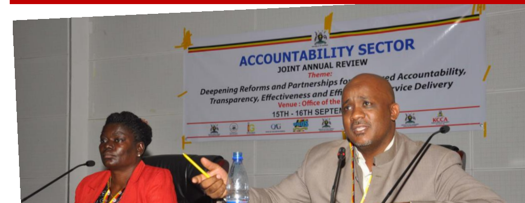
CSBAG presented CSO positions to the Accountability Sector Annual Review on 16 th September 2016 and CSO statement on National Budget Strategy FY2017/18 at the National Budget