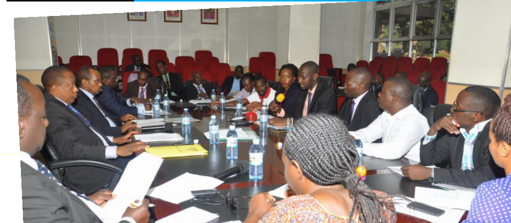
CSBAG submitted the Quarter 4 budget performance monitoring CSO report on 30 th September 2016 to Ministry of Finance Offices.