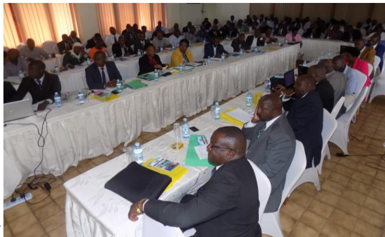
Local Government officers during the regional LG budget consultative workshop for Western region held in Mbarara.

The last round of the regional budget consultative meetings was held 26 th -27 th September 2015 in Seeta, Jinja, Mbarara and Lira. This week we focus on one key issue that has dominated these discussions throughout the 20 workshops and this is the issues of local government financing.