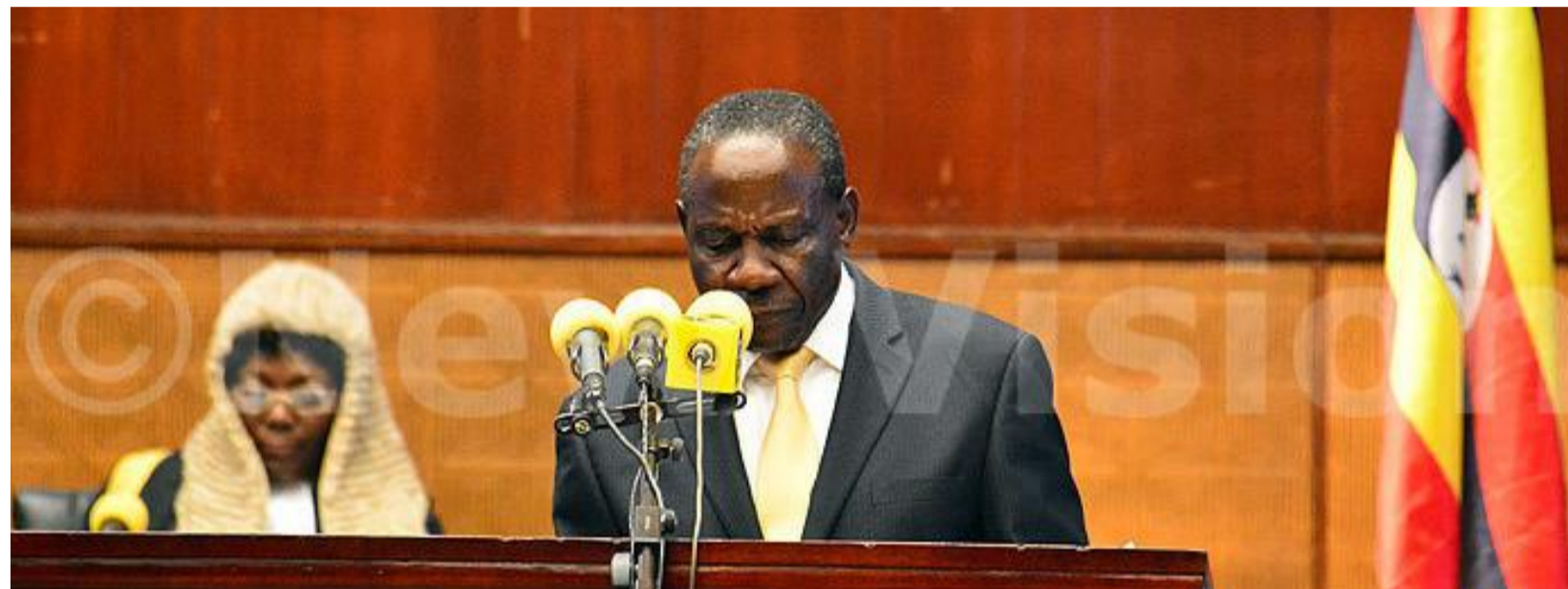
Hon Matia Kasaija reading the National Budget speech FY2016/17

“On 8th June 2016, Hon Matia Kasaija on behalf of H.E the President read to the National the Financial Year 2016/17 National Budget Speech. Civil Society Budget Advocacy Group (CSBAG) presents a quick analysis of the budget in this week’s Edition”.